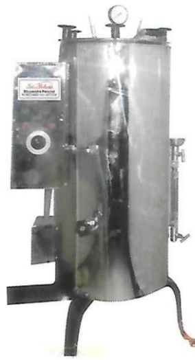
Semi Automatic Double Drum Autoclave Machine SM-1115