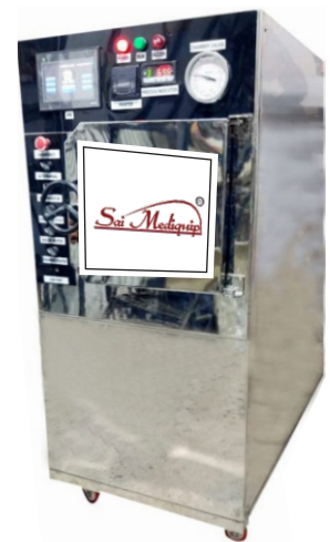
Fully Automatic PLC Based ETO Sterilizer SM-1118