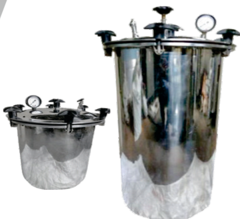
Cylindrical Vertical Autoclave SM-11120