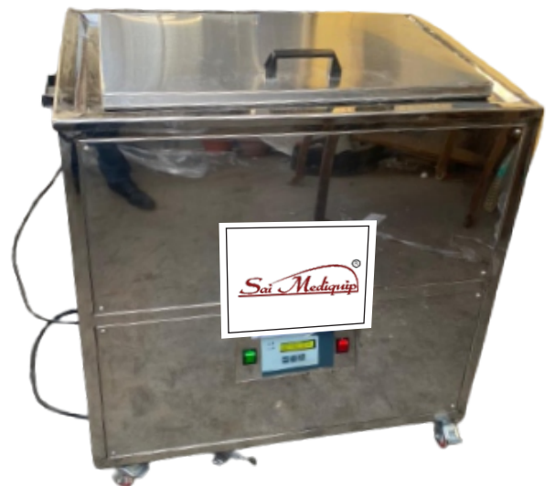
UltraSonic Washer SM-1119