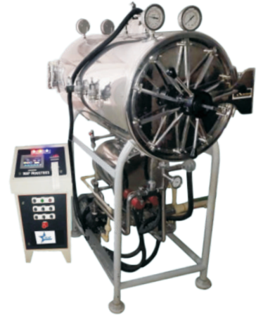
Cylindrical on Stand SM-1116