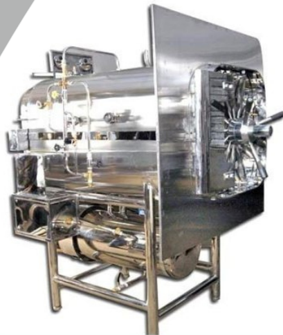
Rectangular on Stand SM-1117